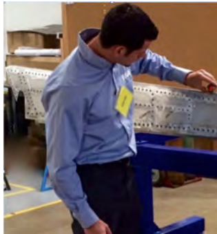
Laser Tracker – 3D Capture