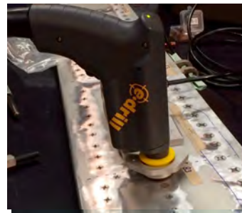
EDrill Fastener Removal